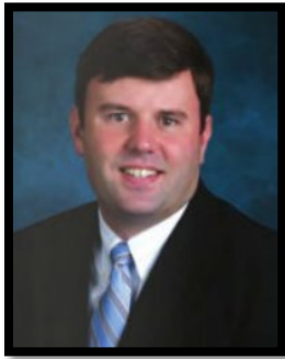
Ben Lee Chair